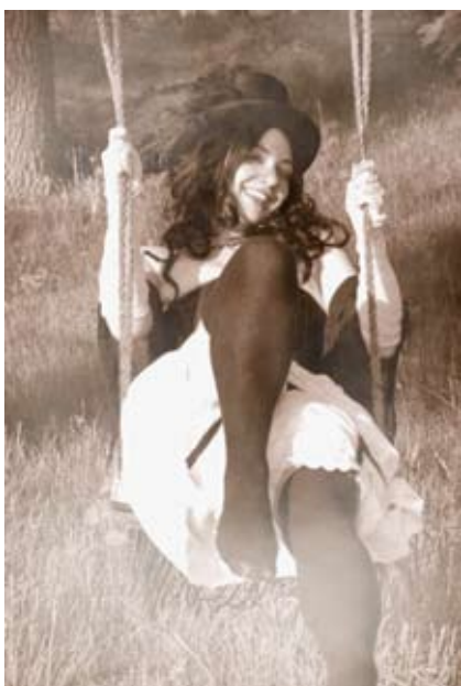
Several of over 20 images capturing the Binnewater Gang in action