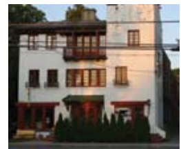
Above The Colony Cafe, Woodstock, NY

Save the date! Sunday October 28th, 2-6pm WSW's 31st annual fundraising auction, Look for ticket information & item previews at www.wsworkshop.org